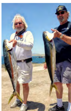
TOP LEFT: Fishing at Cedros Island. TOP CENTER: Roosterfish caught in La Paz. RIGHT: Dorado caught in the East Cape. BOTTOM LEFT: Yellowfin tuna caught in Los Cabos. BOTTOM CENTER: Fish caught at Bahía Asunción.