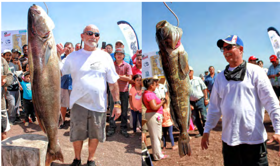
Winners from the San Quintin Pesca La Baja tournament.

The 17th Annual Bisbee's East Cape Offshore Tournament was held in early August of 2016. The weather was great for the 65 teams with 429 anglers. An exciting new Release Category was added for teams preferring to release or that hooked billfish failing to make the qualifying weight of 300 pounds.