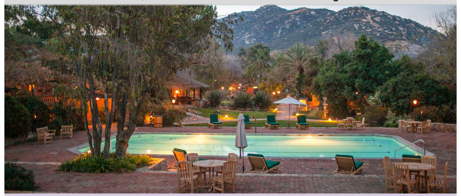
I would love to go on a week spa trip at Rancho La Puerta. I could use a nice massage, facial and just escape with a glass of champagne by the pool. - Monica

The smell of fall is in the air and for the team at Discover Baja, that means we're dreaming of heading south where the weather on the peninsula is perfect and the food, relaxation and adventures are calling.