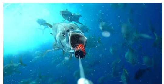
1: A 147.6-pound black seabass caught by Ricardo Elizondo. 2: Carmen Island yellowtail. 3: Mike Little with a roosterfish 4: Still from Renegade Mike's Water Wolf 7